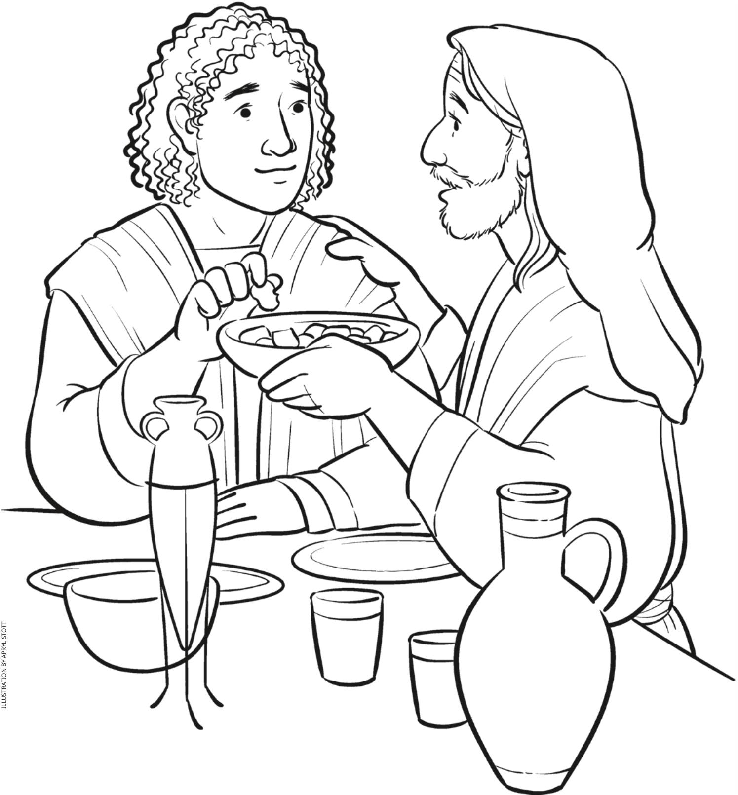
ILLUSTRATION BY APRYL STOTT