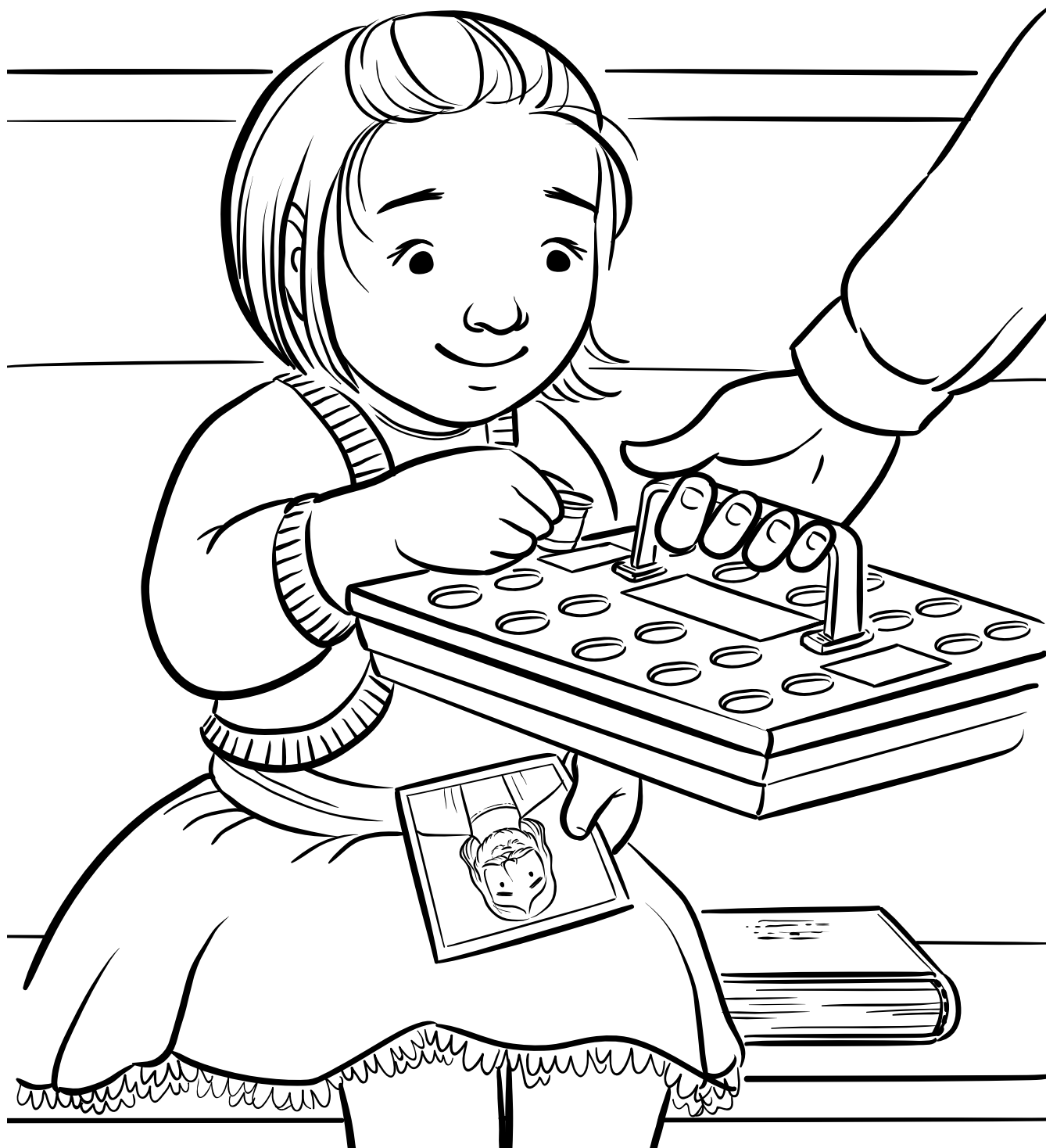
ILLUSTRATION BY APRYL STOTT